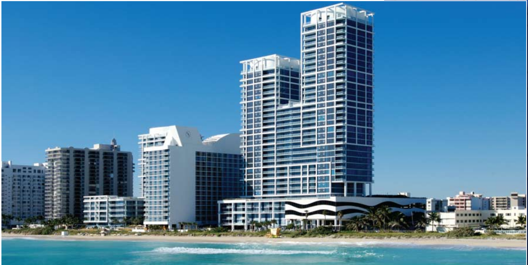
Canyon Ranch – Miami Beach, Florida