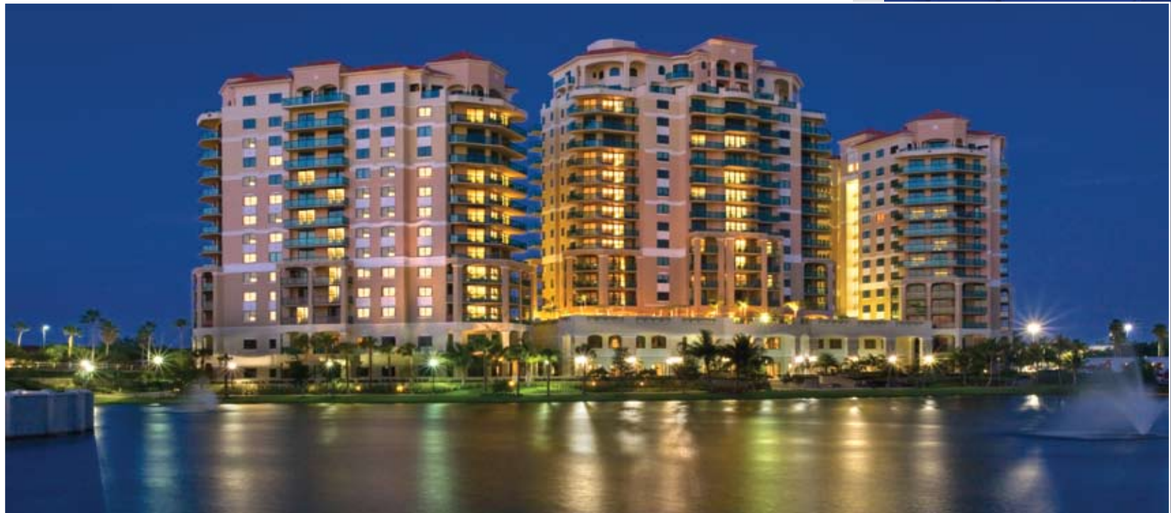
Landmark at the Gardens – Palm Beach Gardens, Florida