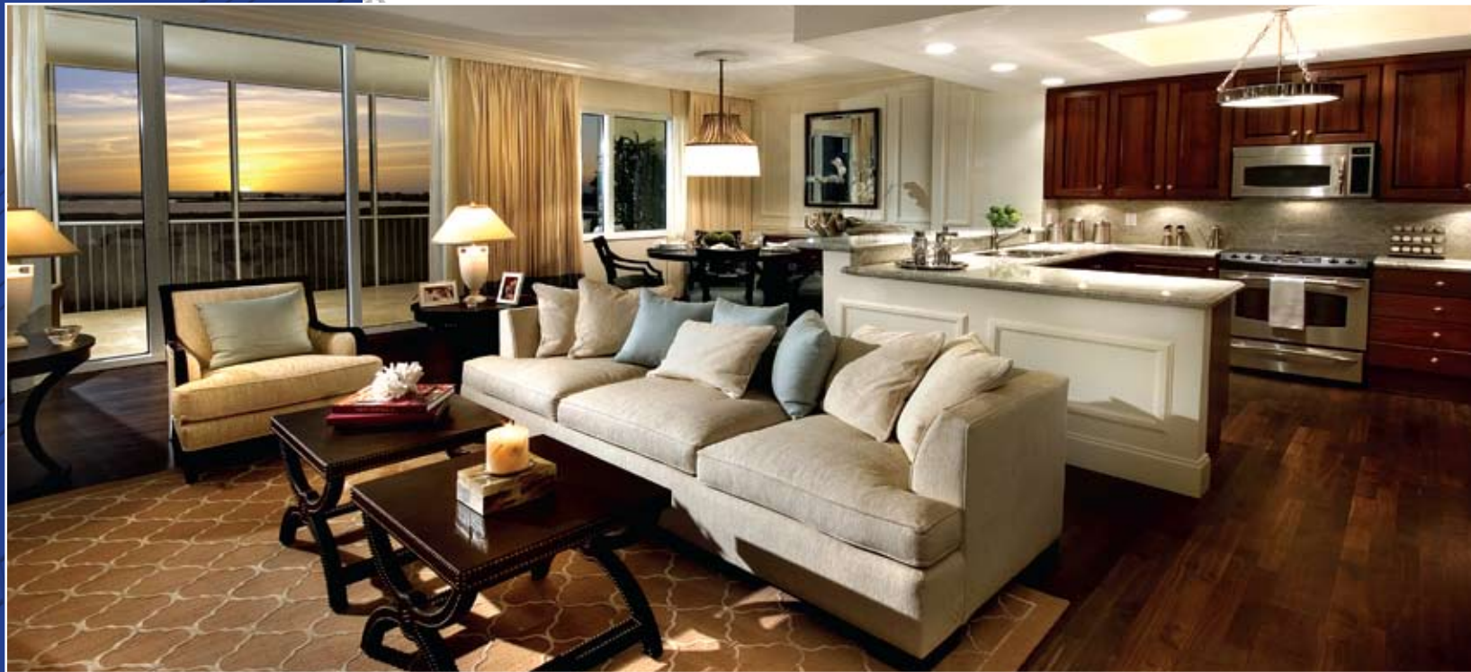
Jasmine Bay – West Bay Club, Estero, Florida