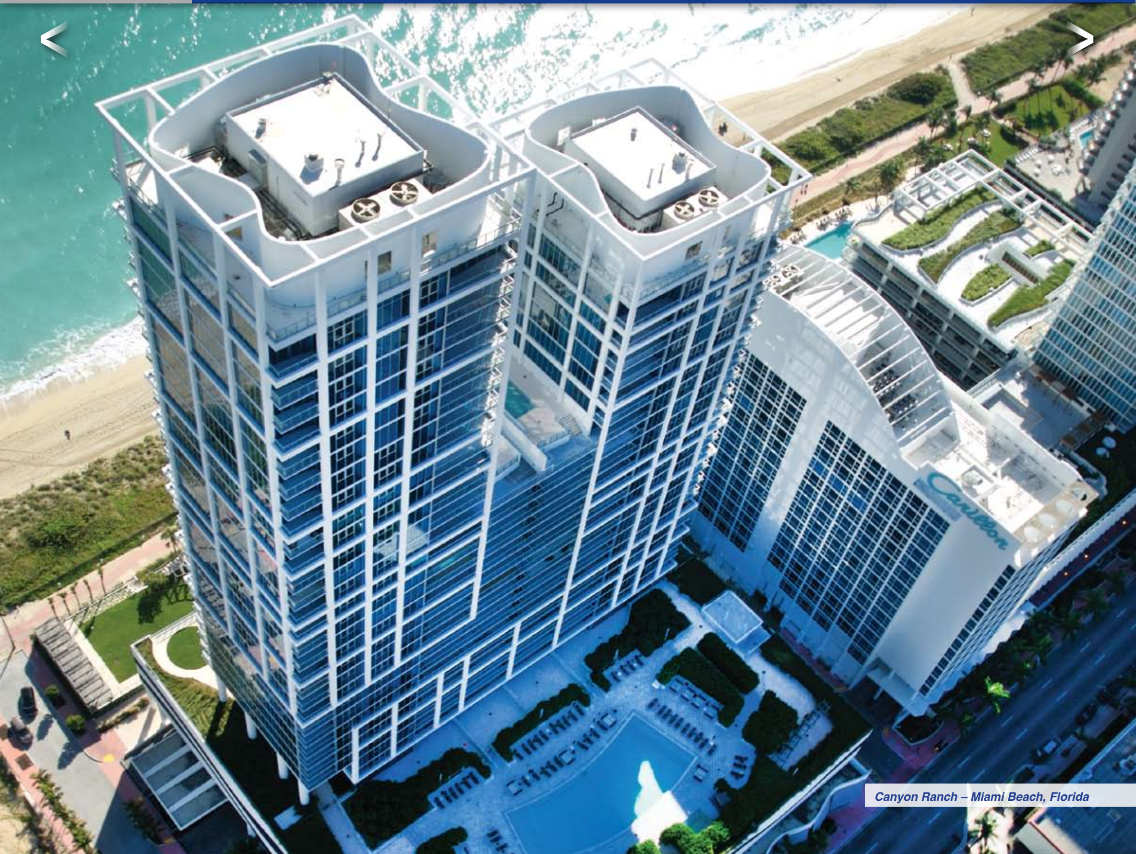
Canyon Ranch – Miami Beach, Florida