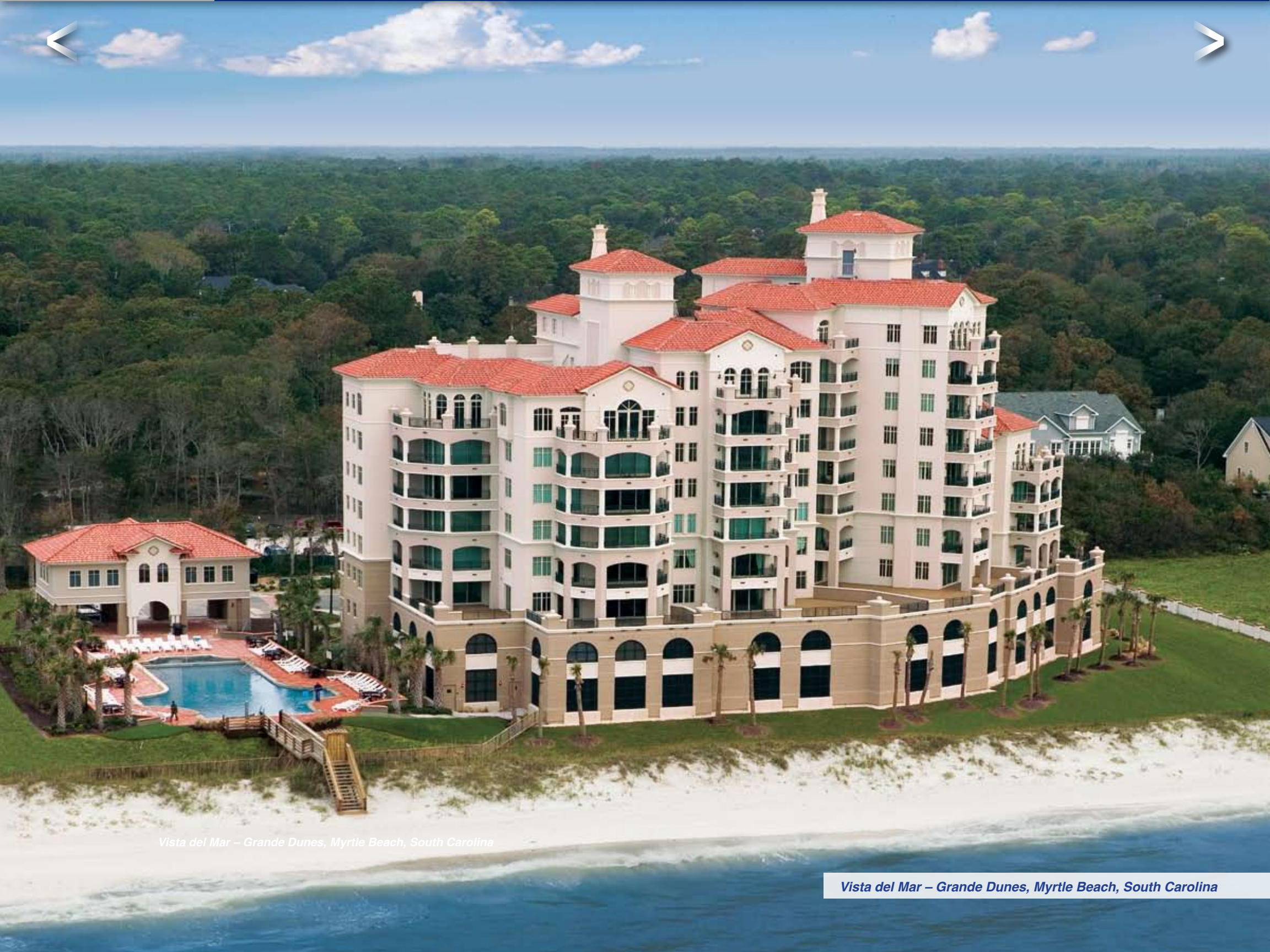
Vista del Mar – Grande Dunes, Myrtle Beach, South Carolina