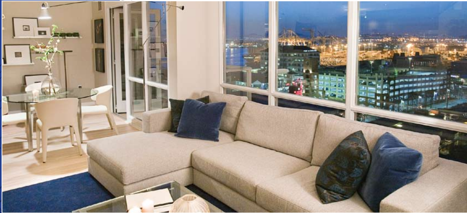
The Ellington – Jack London Square, Oakland, California